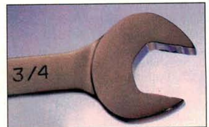
Mac Tools Circle Number 150

Rounding of the fastener head describes the damage that occurs when too much force is applied over too small an area. The pressure of the wrench concentrated on the small area of the fastener-corner strips the metal from the fastener. The increased contact area of Knuckle Saver System wrenches solves the problem of fastener damage. The patented, contoured profile redistributes the stress evenly over a large area of the fastener head. Contact area is four times larger than for other wrenches of the same size, according to the manufacturer.