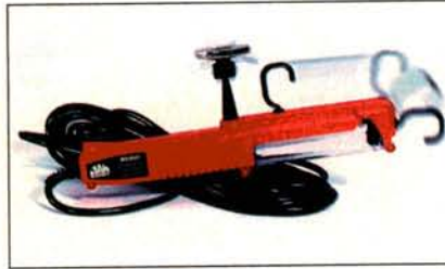
Mac Tools Circle Number 148

Mac Tools has introduced a series of impact-resistant work lights that illuminate with a cool fluorescent light, reducing burn, shock, and broken glass hazards. The compact and lightweight TFL series of fluorescent work lights are designed to bounce instead of break. For impact resistance, all models feature hard/soft end caps, internal shock absorbers and a rough service bulb.